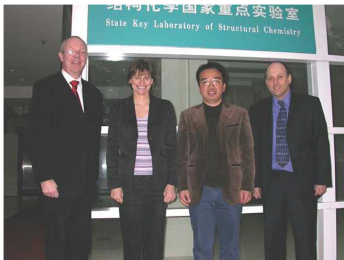
Fig. 2 Visiting State Key Laboratory of Structural Chemistry in Fuzhou.

of these visits was to strengthen links with Chinese institutions and improve our understanding of chemical research in China. Research is developing at an impressive pace: Funding is increasing, as are the numbers of researchers at all levels, and there is a substantial investment in new buildings and research facilities (Fig. 3). Research output will clearly continue to grow at a fast pace and to increase in importance. There is commitment from Universities and Institutes in China to increase the quality of research and articles published in international journals, and there is wide success in meeting this goal. The RSC is enthusiastic to support this through working with authors and our unbiased editorial policies and procedures. We strongly encourage submission of the highest quality work from China. To aid authors our Information for Authors and Ethical Guidelines for publishing in RSC journals are available from our web site in Chinese (visit http://www.rsc.org/resource ).