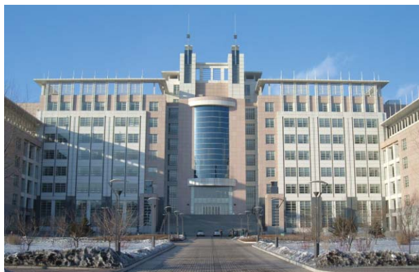
Fig. 3 Undergraduate Teaching Laboratories, Jilin University.

micro-channels, micro-total analysis systems and microfluidic devices.